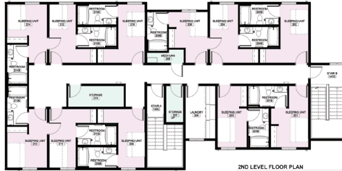
2ND LEVEL FLOOR PLAN 31'0" x 17'0"