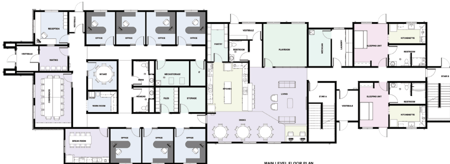
MAIN LEVEL FLOOR PLAN 30'0" x 11'0"